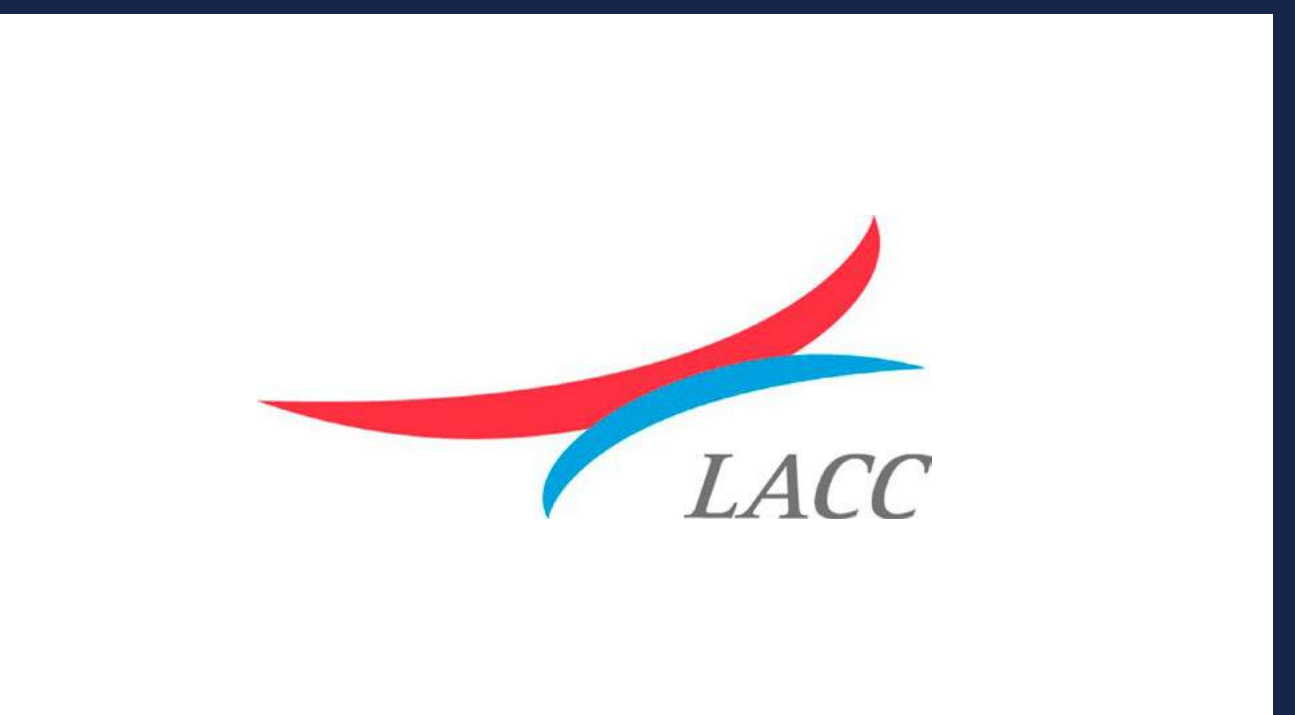
Membership with the Luxembourg American Chamber of Commerce!

As a valued reader of the Luxembourg Business Journal, The Luxembourg American Chamber of Commerce (LACC) would like to take this opportunity to highlight the many benefits of membership with the LACC. As an organization, we understand the challenges of the modern business world, and strive to support our members through an array of initiatives that we are eager to share with you!